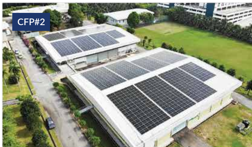
Montfort Boys Town 460 kWp Solar PV under NEM 2.0 scheme (CFP#2)